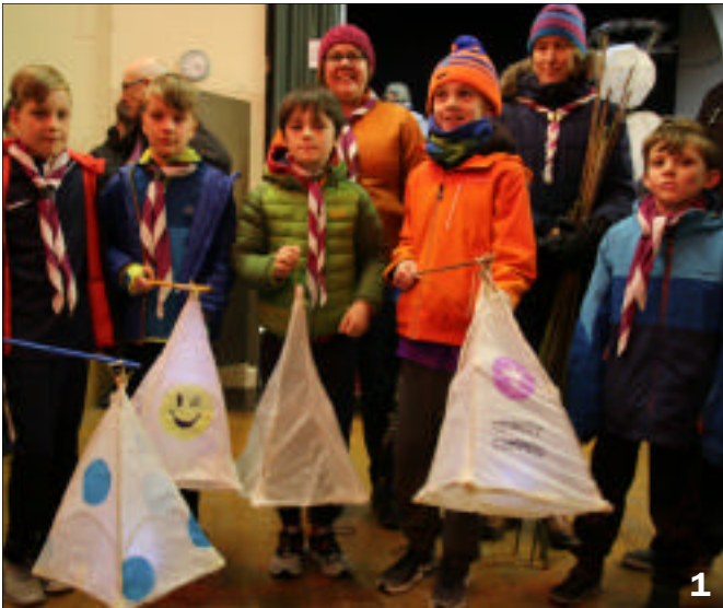
1. Members of Trinity Fammau scouts with the pyramid shaped lanterns they made for the parade.