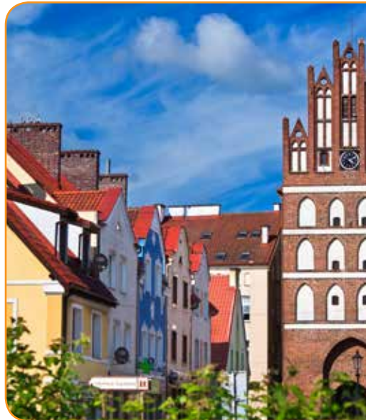
Old town houses and Lidzbark Gate in Bartoszyce