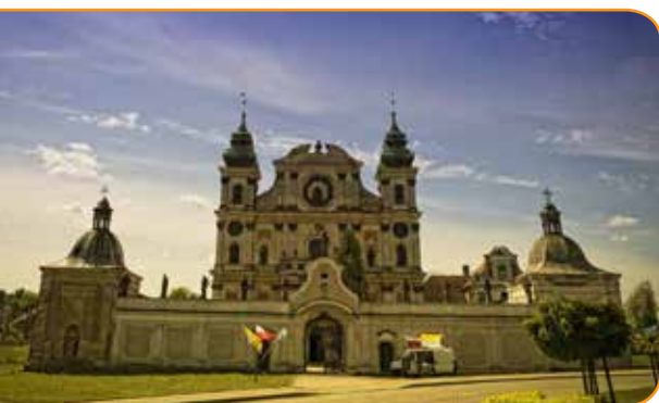
The Sanctuary of the Visitation of the Blessed Virgin Mary and St. Joseph in Krosno, located near the route, photo from the archive of the Orneta Town and Commune Office

Those travelling along the route can take advantage of Cyclist Service Points equipped with racks, benches, tables, umbrella roofs, bins and information boards. Tourists are also awaited at Cyclist-Friendly Places, i.e. recommended objects (accommodation, gastronomy, services) adapting their offer to the needs of cycling enthusiasts.