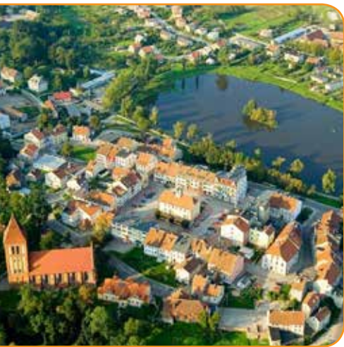
Górowo Iławeckie – the city on Green Velo route