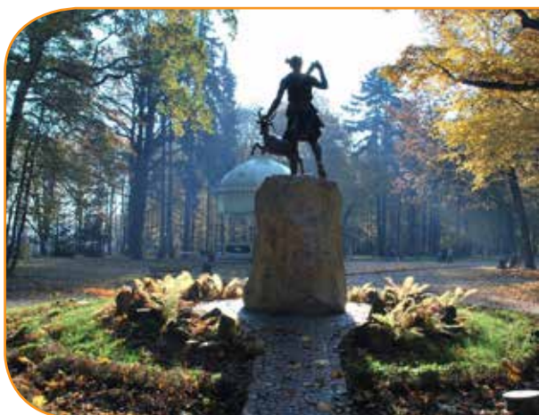
The city park in Prudnik

The cycling infrastructure of the Opawskie Mountains enables organization of events for amateurs and professionals alike. The best known of them is the Stanisław Szozda Memorial Race, ranking every two years as a qualification round for the Championship of Poland in the Street Criterion.