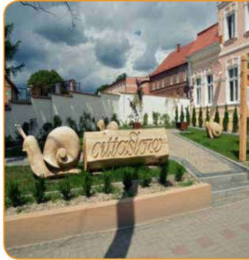
Cittaslow Square in Lidzbark, photo by Natalia Sieg

On the following pages of this publication, we will present assorted attractions of each town, suggesting several trips to allow you to feel their unique atmosphere. Current information on what is going on in each town can be found at www.cittaslowpolska.pl .